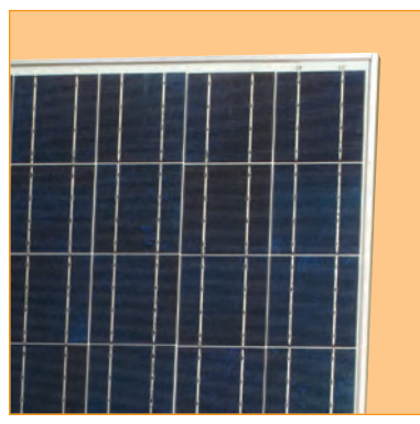
Solder-coated grid results in high fill factor performance under low light conditions.

This poly-crystalline 216 watt module features 13.3% module efficiency for an outstanding balance of size and weight to power and performance. Using breakthrough technology perfected by Sharp's 48 years of research and development. The ND-216U2 modules incorporate an advanced surface texturing process to increase light absorption and improve efficiency. Common applications include commercial and residential grid-tied roof systems as well as ground-mounted arrays. Designed to withstand rigorous operating conditions, Sharp's ND-216U2 modules offer high power output per square foot of solar array.