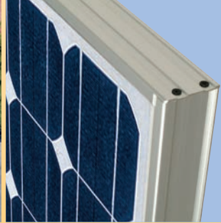
Improved Frame Technology